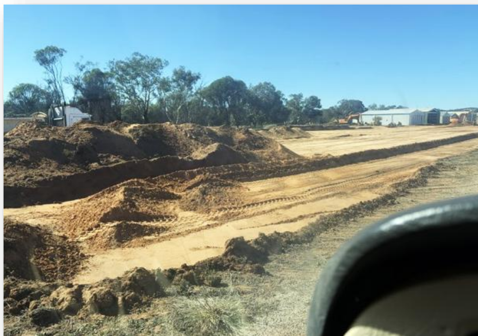
Earthworks Northam Aero Club 12 May 2026