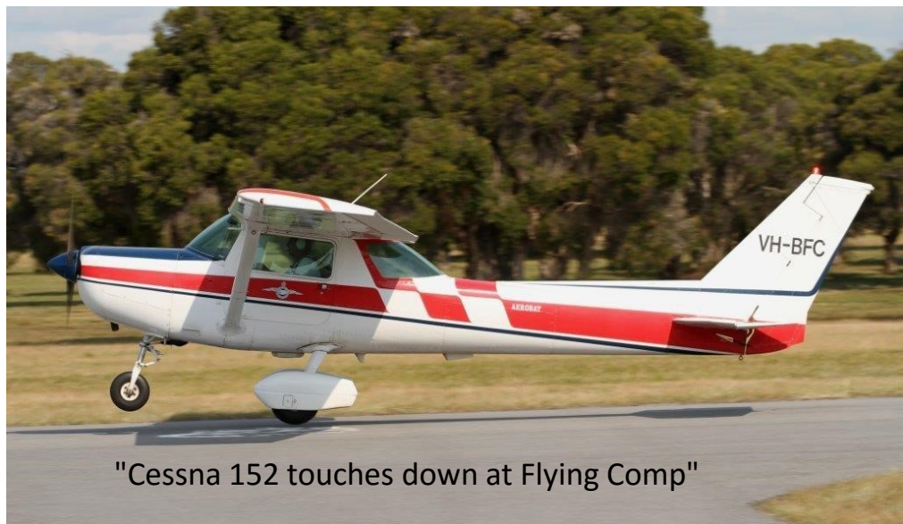
"Cessna 152 touches down at Flying Comp"

Club Captain 0450415947 prh@aurora.net.au