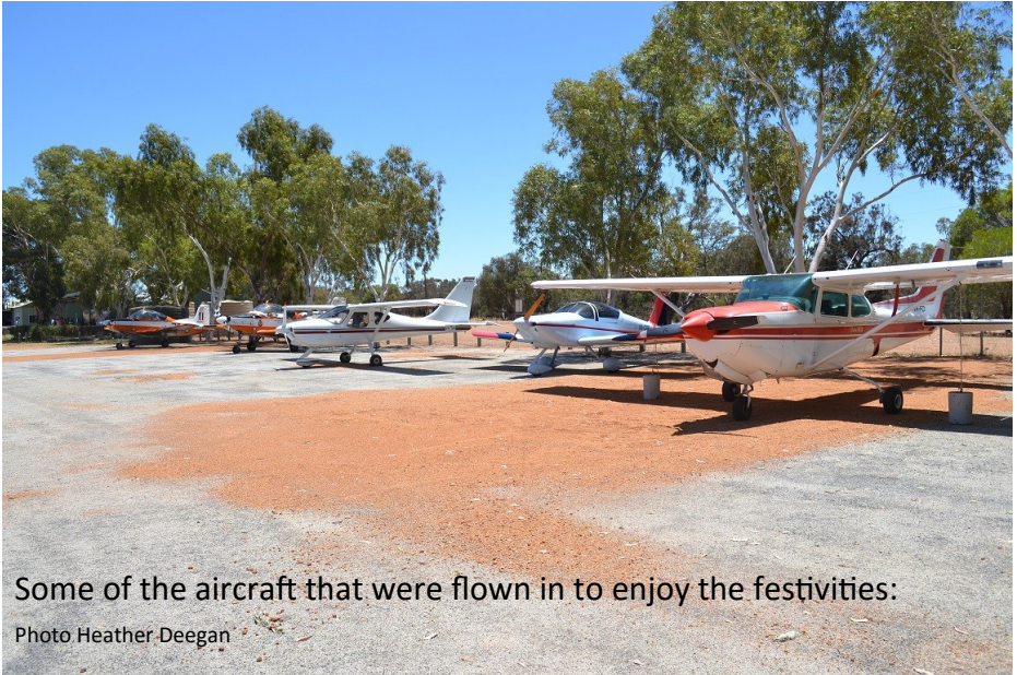
Some of the aircraft that were flown in to enjoy the festivities: