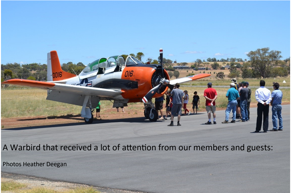
A Warbird that received a lot of attention from our members and guests: