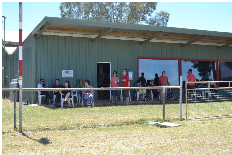
Above: NAC Members and guests watching aircraft movements