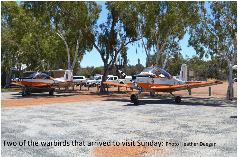
Two of the warbirds that arrived to visit Sunday: Photo Heather Deegan