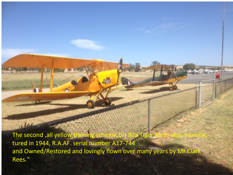
The second ,all yellow training scheme DH 82a Tiger Moth was manufactured in 1944, R.A.AF. serial number A17-744 and Owned/Restored and lovingly flown over many years by Mr.Clark Rees."