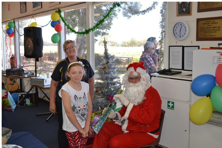
Above: Father Christmas and his helper hard at work distributing gifts