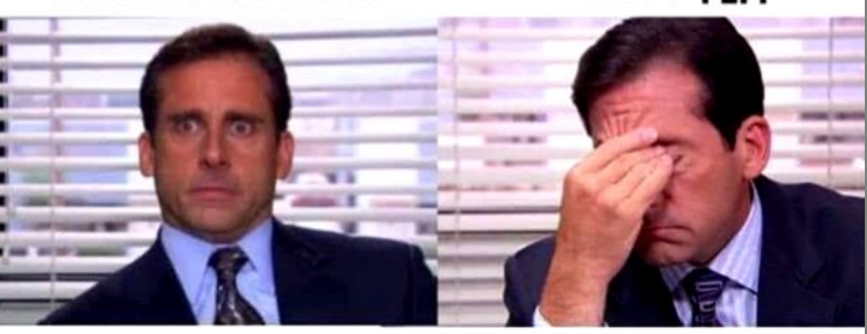
What was that noise?