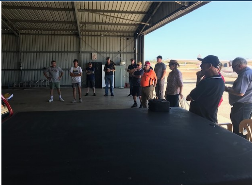
Briefing time at Murrayfield with Royal Aero Club and Northam Aero Club