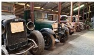
Sneak peek at Wylie Museum