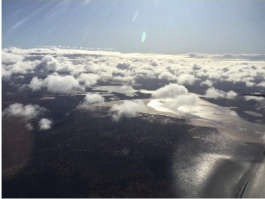
Figure 1 Near Lake Baladjie

0730 local 9 th August we departed Wongan for Forrest with a refueling stop at Kalgoorlie. At 5,500 ft we were fortunate to have 55knot tailwind giving ground speed between 155 and 162 knots.